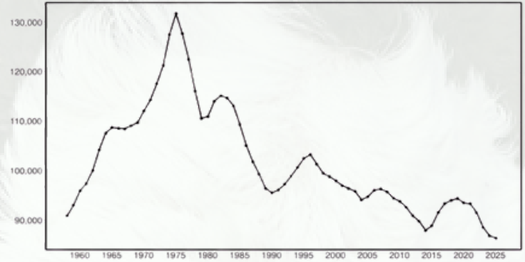
January 1 All Cattle and Calves Inventory, 1,000 Head.

U.S. cattle inventories are at their lowest since the 1950s, totaling 86.7 million head as of January 1, 2025. Arkansas cattle inventory in 2025 totaled 1.56 million, Kentucky totaled 1.85 million, and Mississippi totaled 810 million, all the lowest inventories in at least the last 60 years. The U.S. cattle industry began cattle herd liquidation when inventories peaked at 94.7 million head in 2019 and have reduced by eight million head since that time (chart above). Liquidating inventories is one phase of the cattle cycle, a 10-12-year pattern of expanding and contracting cattle numbers driven by changes in producer profitability and worsened by drought. The impacts of historically tight cattle numbers are being felt at every stage of the beef supply chain.